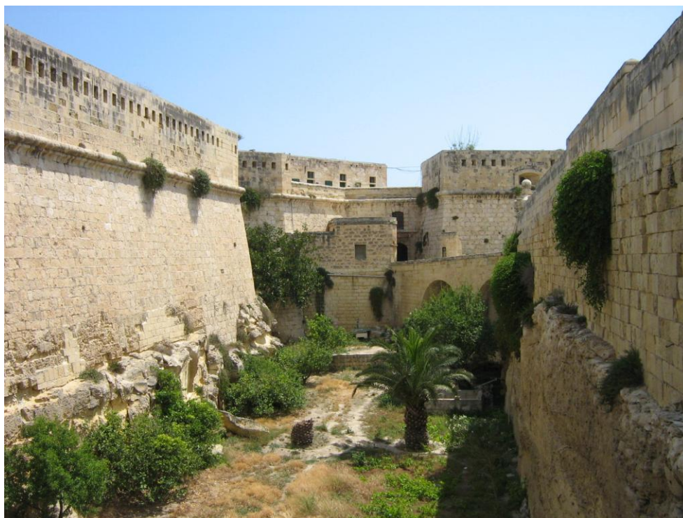
Figure 1. A key aspect of the tourist image of Malta: Fort Saint Elmo in Valetta.

The next step in this market research is to analyse the supply side in order to know if it meets the demand of the future ECOC visitor. When considering the entirety of the Maltese cultural tourism offer (museums, monuments, routers, events), there is one strength that immediately catches the eye: the omnipresent built heritage which is promoted by the official Malta Tourism Website in the following terms: In Malta, you'll explore 7000 years of history yet live passionately in the present (...) the Islands' scenery and architecture provide a spectacular backdrop. The Maltese Islands have been described as one big open-air museum(...).What makes them unique is that so much of their past is visible today. Delve into the Islands' mysterious prehistory, retrace the footsteps of St Paul or see where the Knights of St John defended Christendom. ( www.visitmalta.com ) (figure1).