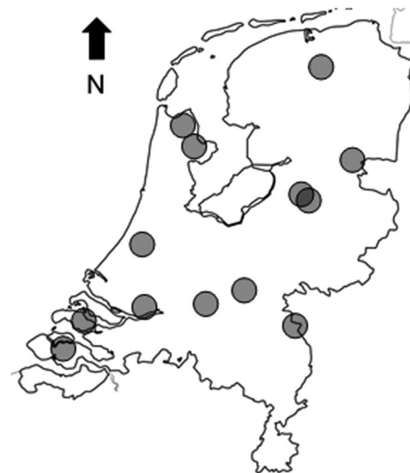
FIGURE 1 Distribution of the investigated hunting leases in the Netherlands with European hare ( Lepus europaeus ). The characteristics of hunting leases can be found in Appendix S1

Our paper investigates the correlations between the assumed influence of multiple predators and the body condition and fecundity of a mammal prey species in a field situation, which has been done only few times. We hypothesized that higher risk from multiple predators is related to higher stress levels, and lower prey body