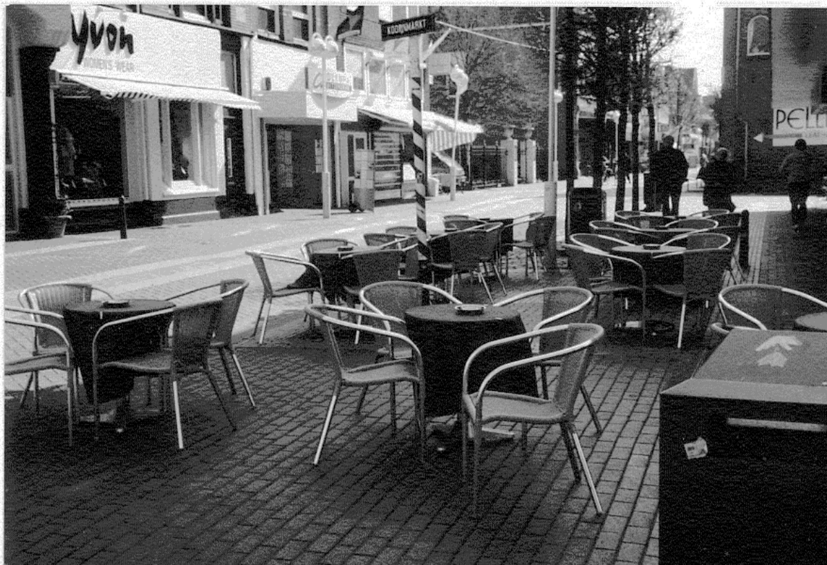
Figure 1: an example of a photograph, made by a person in a therapeutic photo-group.

Making a photograph the pictured information is limited to a pinpointed moment in time. The spatial involvement is cropped into the encadrement of a photograph. This selectiveness of visual information in a photograph invites the photographer to interpret the image as standing for hidden meanings and connect these with his own inner representations of reality. But the same happens with others who view the photograph and make their own interpretation. We organised photo-groups in mental health care settings. This was done for therapeutic reasons: helping persons with severe mental illness (SMI) to give meaning to their life story. We show one of the photographs, made by William (Fig. 1).