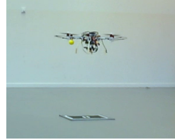
Fig. 4: Experiment with the target finding and landing state.

a camera placed in a downward-facing gimbal and land automatically [8]. The deviations from the x and y axes of the camera are used to control Roll and Pitch respectively. The throttle is controlled based of the values of an ultrasonic sensor. Figure 4 shows the test setting for this state.