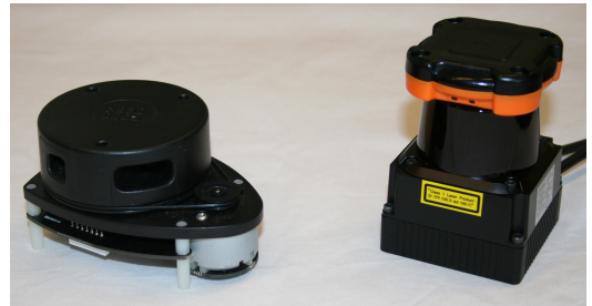
Fig. 2: The RP-Lidar and UTM-30LX, respectively.

RP-Lidar and UTM-30LX Two lidars (Light Detection And Ranging) have been coupled to the Twirre architecture. The addition of a lidar sensor allows mapping of rooms. It also makes obstacle detection or avoidance possible. The first is the RoboPeak RP-Lidar, which is a 360 degree laser scanner [4]. The second lidar is the Hokuyo UTM-30LX, which has a 270 degree scanning range [5]. There is a large difference between the system specifications and prices. Table 2 lists a few specifications of both devices.