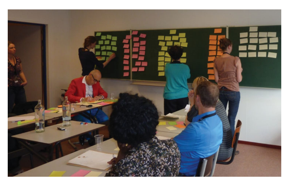
FIGURE 1 View of one of the sticky notes sessions.

and share it with the group (Ismail, 2013), so the participants needed to be concise in their responses. There was no limit on the number of ideas that the participants could write down. However, the ideas had to be related to the theme of the session: the future nursing home.