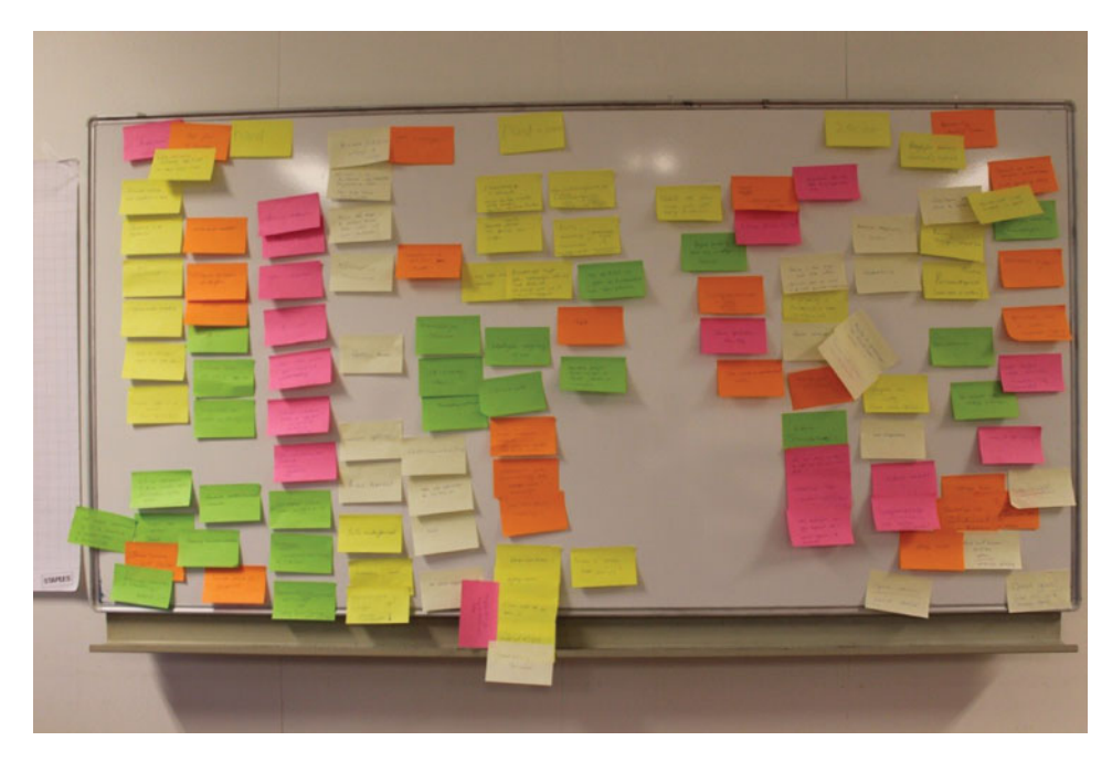
FIGURE 2 Process of clustering the sticky notes.

to English. To find out how often certain themes and subjects emerged in the notes, word clouds were made (Godwin-Jones, 2006; Rivadeneira, Gruen, Muller, & Millen 2007; Seifert, Kump, Kienreich, Granitzer, & Granitzer, 2008; Viégas & Wattenberg, 2008) using the five colors of the notes. This showed the main points of focus in the groups. A word cloud is a visual representation for textual data, typically used to depict keyword metadata (tags) on Web sites or to visualize free-form text. Tags are usually single words, and the importance of each tag is shown with font size or color. This format is useful for quickly perceiving the most prominent terms and for locating a term alphabetically to determine its relative importance.